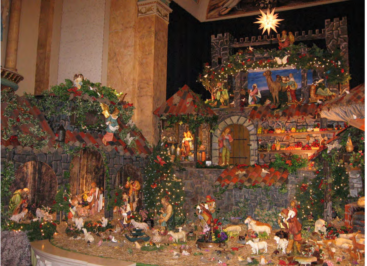
Above: The praesepe at Our Lady of Mount Carmel Church in Altoona, PA.