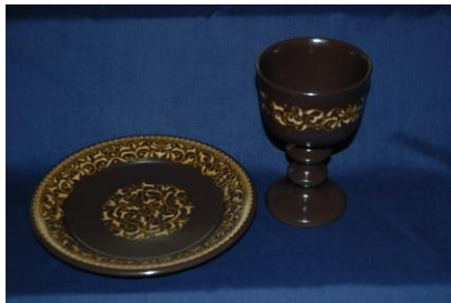
◀ Ceramic chalice and paten (unknown origin): chalice 6 ½" high; paten 9" diameter