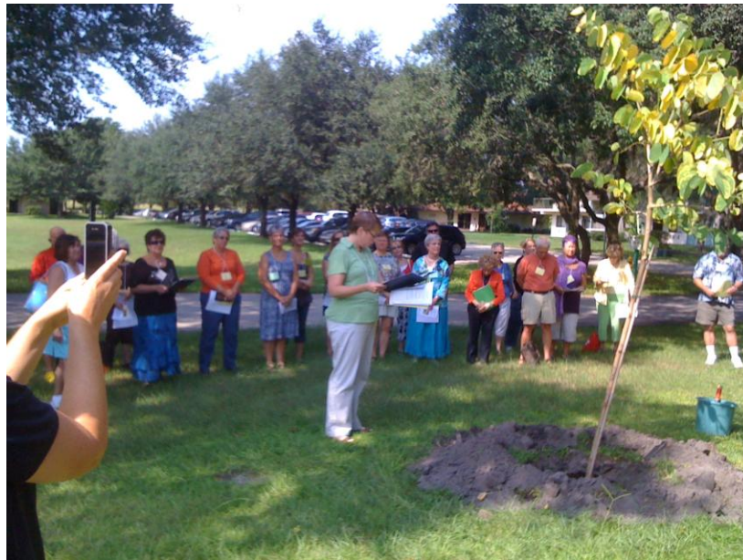
Members of the Audire community plant a tree on the grounds of San Pedro Center, Winter Park, FL.