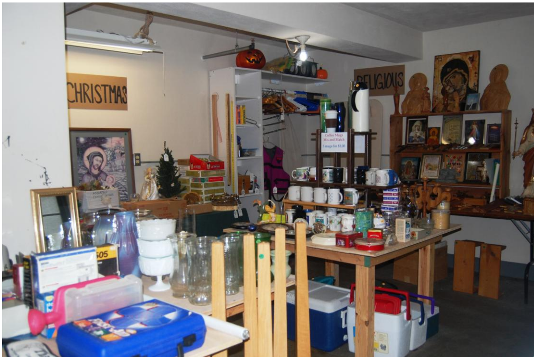
The former laundry area contained religious goods and house ware items.