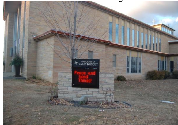
The newly designed and constructed digital sign for the Church of Saint Bridget.