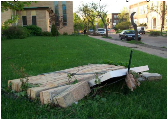
The damaged church sign following the tornado...

One of the amazing acts of damage resulting from the tornado that struck North Minneapolis in May, 2011 was the collapse of the heavy stone sign for the Church of Saint Bridget on the northeast corner of the property. Parts of the church sign were found in classrooms of the school on the other side of Emerson Avenue. Saint Bridget church was on the left edge of the damaging path of the tornado. Extensive repairs to the school were completed in time for the opening of the new school year in September. Following the repair of the school, the church roof and windows were replaced and other ancillary repairs were completed. The last item to be repaired was the church sign. Saint Bridget's now boasts a beautiful, new, digital sign housed within a construction of stone salvaged after the tornado.