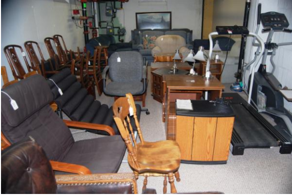
The former recreation room contained furniture and lamps.