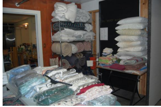
The art studio was packed with linens.